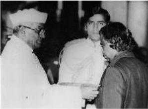
Plate 17 Receiving the Padma Bushan from Dr Neelam Sanjeeva Reddy, then President of India.