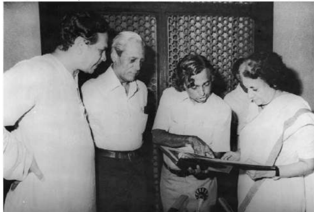
Plate 15 Prof Satish Dhawan and I explaining SLV-3 results to Prime Minister Indira Gandhi.

final phase of integration. He helped me deal with subsequent frustrations in its launching and consoled me when I was at my lowest ebb.