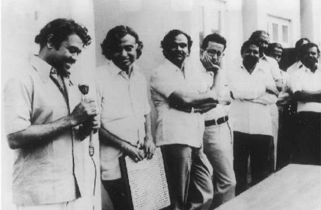
Plate 13 A presentation by a member of my SLV-3 team. In an unusual move, I made each of them present their portion of the work—my idea of project management.