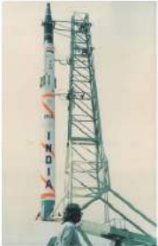
Plate 19 Agni on the launch pad, my long-cherished dream.