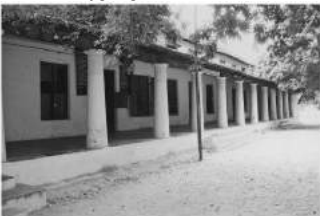
Plate 7 The simple surroundings of Schwartz High School, Ramanathapuram. The words on the plaque read "Let not thy winged days be spent in vain. When once gone no gold can buy them back again."