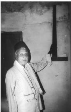
Plate 4 My brother pointing at the T-square I used while studying engineering.