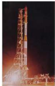
Plate 16 SLV-3 on the launch pad. This gave us many anxious moments!