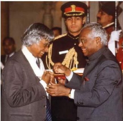
Plate 23 Receiving the Bharat Ratna from President KR Narayanan.