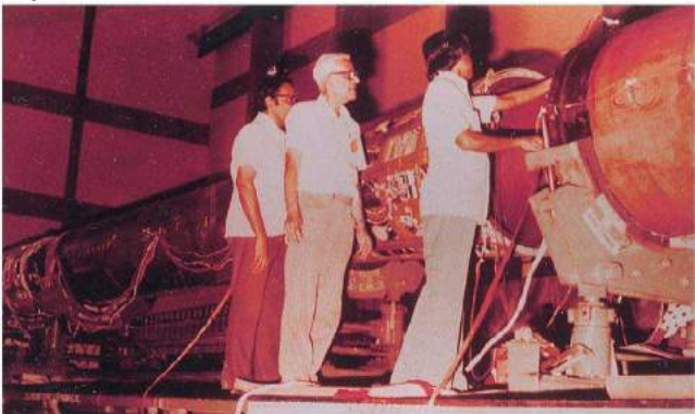
Plate 14 Dr Brahm Prakash inspecting SLV-3 in its