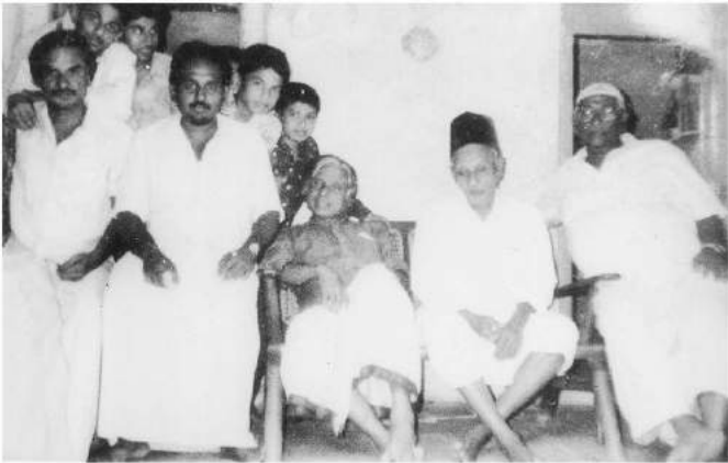
Plate 6 A family get-together.