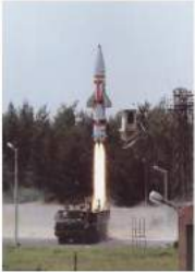
Plate 18 Successful launch of Prithvi, the surface-to-surface weapons system.