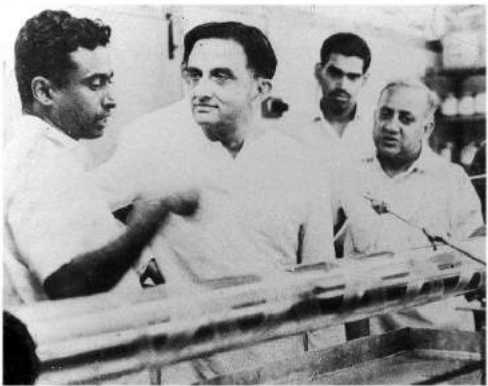
Plate 11 With Prof Vikram Sarabhai, a great visionary and the master planner behind India's Missile Development programme, at Thumba