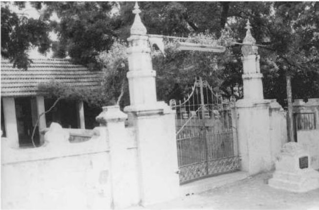
Plate 3 The old mosque in our locality where my father would take me and my brothers every evening to offer prayers.