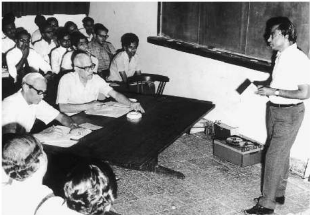
Plate 12 Two gurus of Indian Space Research who mentored and gently guided the young scientists – Prof Satish Dhawan and Dr Brahm Prakash – at one of the SLV-3 review meetings.