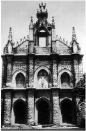
Plate 10 The Christian community in Thumba very graciously gave up this beautiful Church to house the first unit of the Space Research Centre.