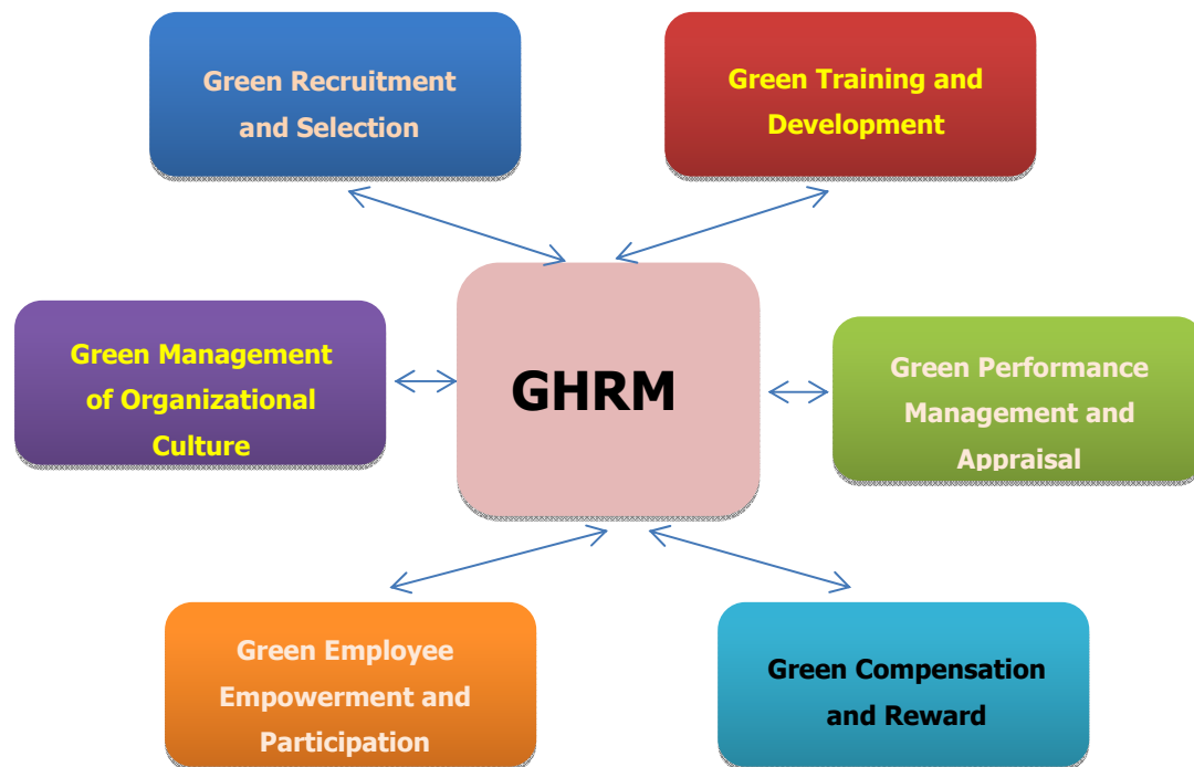
Figure 1. Green human resource management model

Creating awareness and developing GHRM practices, is not necessarily enough in achieving the optimal green initiatives. On the contrary, there is a need for an organization to embed these initiatives and policies onto its organizational culture through continuous appraisal. Asmui, Mokhtar, Musa, and Hussin (2016), notes that organizational green culture and organizational commitment are two key tools that different organizations must understand in order for them to remain sustainable. It is in this context, that the three authors document the need of the organizations to come up with appropriate strategies of measuring the two determinants from the perspective of the employees. This will assist them to have a better understanding of the different needs of the employees so that they are able to satisfy them accordingly. This will also help such organizations to identify the appropriate strategies to adopt in order for them to maintain the green culture of ensuring that the employees are committed to the green initiatives and focused towards the achievement of the set green goals.