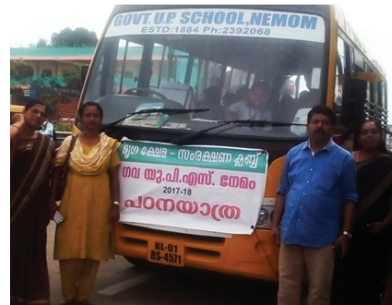
Animal Welfare Club