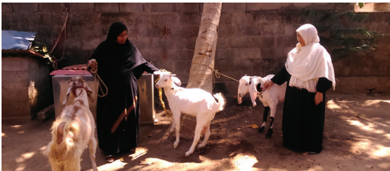
Goat Satellite Unit