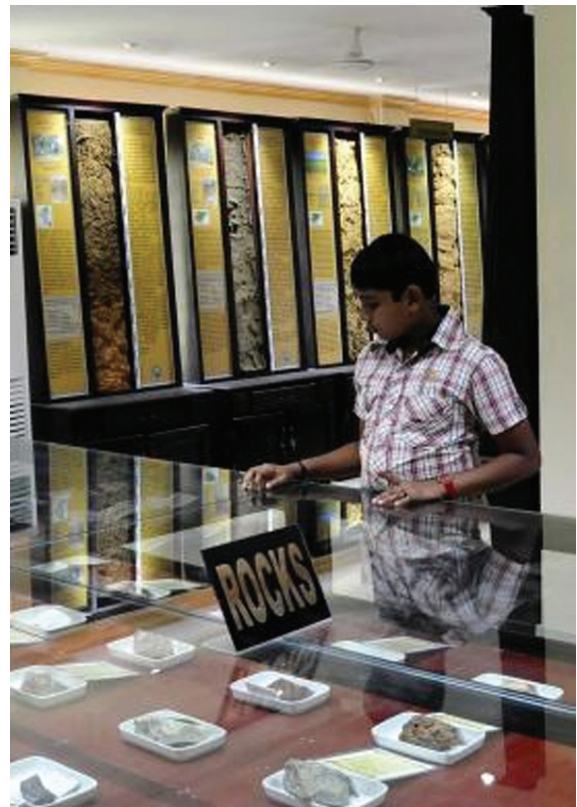
Soil Museum, CSTL, Thiruvananthapuram