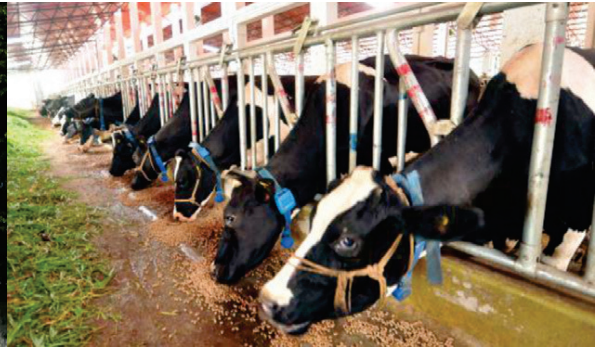
Hitech Dairy Farm, Kuriottumala, Kollam District.