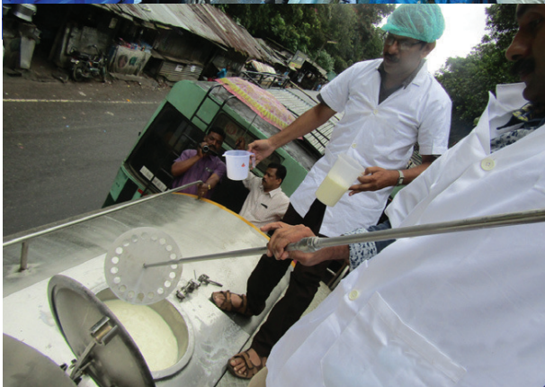
Milk testing at Checkpost