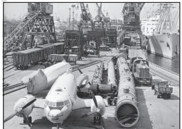
Fig. 9.6: Leningrad Commercial Port