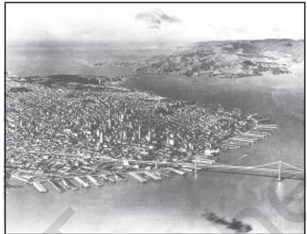
Fig. 9.5: San Francisco, the largest land-locked harbour in the world

The ports provide facilities of docking, loading, unloading and the storage facilities for cargo. In order to provide these facilities, the port authorities make arrangements for maintaining navigable channels, arranging tugs and barges, and providing labour and managerial services. The importance of a port is judged by the size of cargo and the number of ships handled. The quantity of cargo handled by a port is an indicator of the level of development of its hinterland.