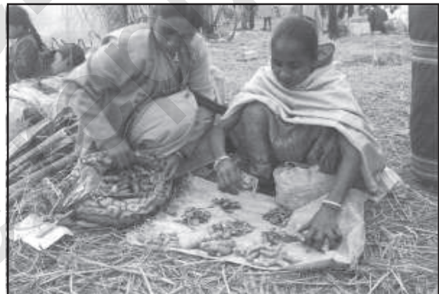
Fig. 9.1: Two women practising barter system in Jon Beel Mela

The initial form of trade in primitive societies was the barter system , where direct exchange of goods took place. In this system if you were a potter and were in need of a plumber, you would have to look for a plumber who would be in need of pots and you could exchange your pots for his plumbing service.