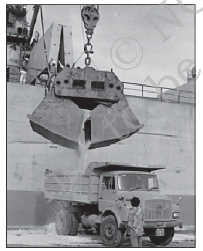
Fig. 11.3 : Unloading of goods on port

India is surrounded by sea from three sides and is bestowed with a long coastline. Water