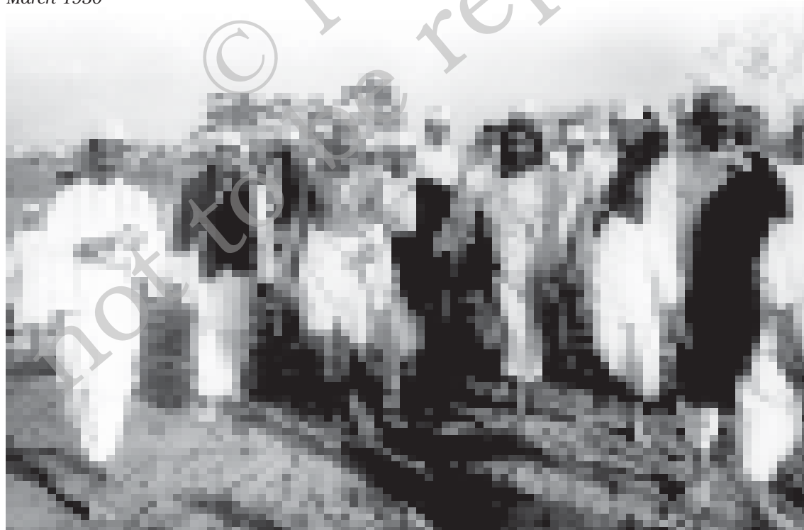
Fig. 13.6 On the Dandi March, March 1930

Soon after the observance of this "Independence Day", Mahatma Gandhi announced that he would lead a march to break one of the most widely disliked laws in British India, which gave the state a monopoly in the manufacture and sale of salt. His picking on the salt monopoly was another illustration of Gandhiji's tactical wisdom. For in every Indian household, salt was indispensable; yet people were forbidden from making salt even for domestic use, compelling them to buy it from shops at a high price. The state monopoly over salt was deeply unpopular; by making it his target, Gandhiji hoped to mobilise a wider discontent against British rule.