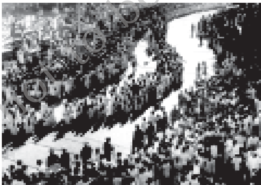
Fig. 13.12 Women’s procession in Bombay during the Quit India Movement

In 1943, some of the younger leaders in the Satara district of Maharashtra set up a parallel government ( prati sarkar ), with volunteer corps ( seba dals ) and village units ( tufan dals ). They ran people’s courts and organised constructive work. Dominated by kunbi peasants and supported by dalits, the Satara prati sarkar functioned till the elections of 1946, despite government repression and, in the later stages, Congress disapproval.