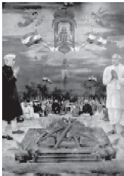
Fig. 13.15 The death of the Mahatma, a popular print

In popular representations, Mahatma Gandhi was deified, and shown as the unifying force within the national movement. Here you can see Jawaharlal Nehru and Sardar Patel, representing two strands within the Congress, standing on two sides of Gandhiji's pyre. Blessing them both from a heavenly realm, is Mahatma Gandhi, at the centre.