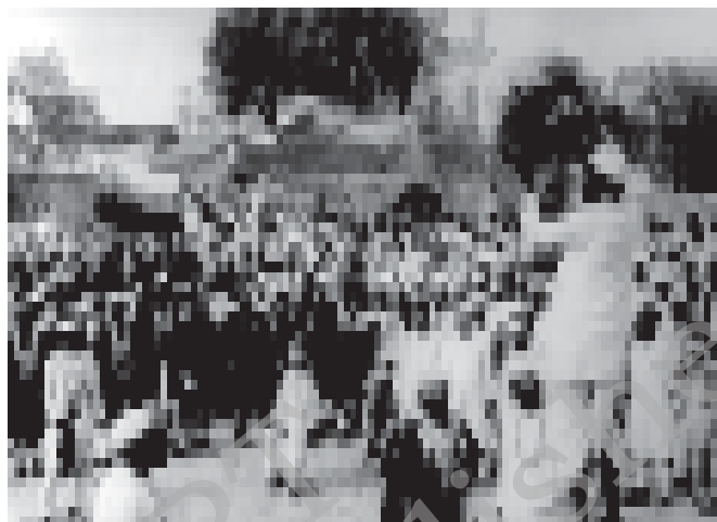
Fig. 13.4 Non-cooperation Movement, July 1922 Foreign cloth being collected to be burnt in bonfires.

By 1922, Gandhiji had transformed Indian nationalism, thereby redeeming the promise he made in his BHU speech of February 1916. It was no longer a movement of professionals and intellectuals; now, hundreds of thousands of peasants, workers and artisans also participated in it. Many of them venerated Gandhiji, referring to him as their