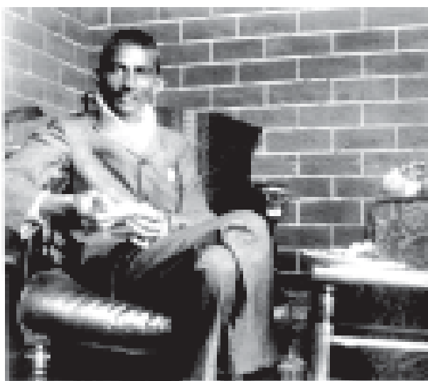
Fig. 13.2 Mahatma Gandhi in Johannesburg, South Africa, February 1908

On Gokhale’s advice, Gandhiji spent a year travelling around British India, getting to know the land and its peoples. His first major public appearance was at the opening of the Banaras Hindu University (BHU) in February 1916. Among the invitees to