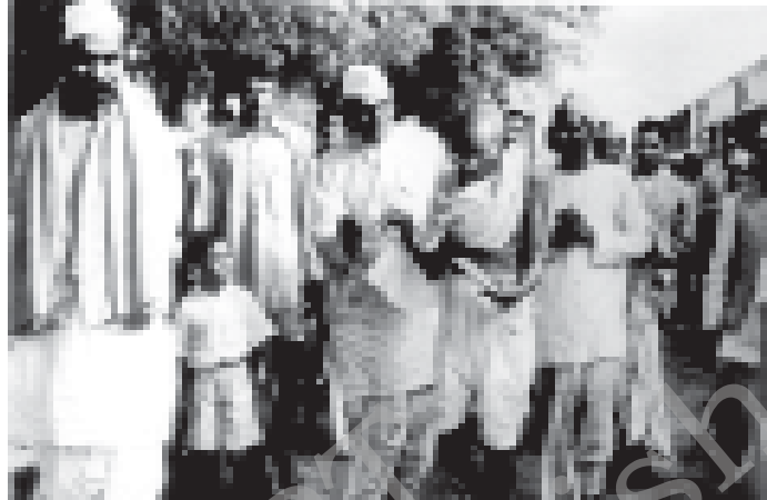
Fig. 13.11 Mahatma Gandhi with Stafford Cripps, March 1942

In the meeting the nature of India's involvement in the War was discussed. When negotiations with the Viceroy broke down, the Congress ministries resigned.