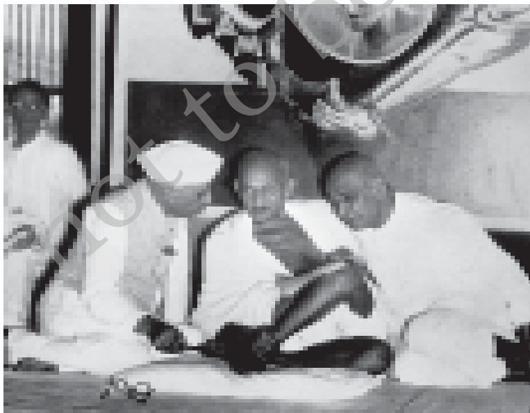
Fig. 13.13 Mahatma Gandhi conferring with Jawaharlal Nehru (on his right) and Sardar Vallabh Bhai Patel (on his left) Nehru and Patel represented two distinct political tendencies within the Congress – the socialist and the conservative. Mahatma Gandhi had to often mediate between these groups.

In February 1947, Wavell was replaced as Viceroy by Lord Mountbatten. Mountbatten called onelast round of talks, but when these too proved inconclusive he announced that British India would be freed, but also divided. The formal transfer of power was fixed for 15 August. When that day came, it