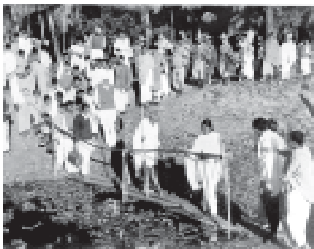
Fig. 13.14 On the way to a riot-torn village, 1947

Many scholars have written of the months after Independence as being Gandhiji's “finest hour”. After working to bring peace to Bengal, Gandhiji now shifted to Delhi, from where he hoped to move on to the riot-torn districts of Punjab. While in the capital, his meetings were disrupted