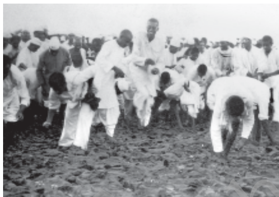
Fig. 13.7 Satyagrahis picking up natural salt at the end of the Dandi March, 6 April 1930

Where most Indians understood the significance of Gandhiji's challenge, the British Raj apparently did not. Although Gandhiji had given advance notice of his "Salt March" to the Viceroy Lord Irwin, Irwin failed to grasp the significance of the action. On 12 March 1930, Gandhiji began walking from his ashram at Sabarmati towards the ocean. He reached his destination three weeks later, making a fistful of salt as he did and thereby making himself a criminal in the eyes of the law. Meanwhile, parallel salt marches were being conducted in other parts of the country.