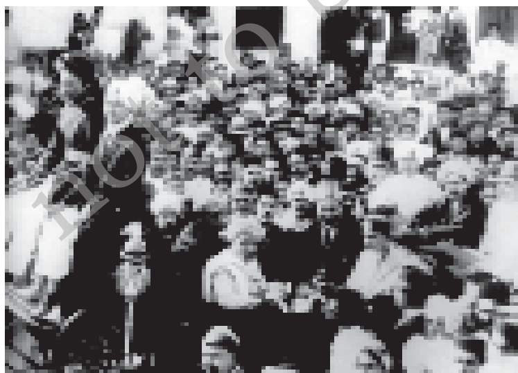
Fig. 13.3 Mahatma Gandhi in Karachi, March 1916

Gandhiji’s speech at Banaras in February 1916 was, at one level, merely a statement of fact – namely, that Indian nationalism was an elite phenomenon, a creation of lawyers and doctors and landlords. But, at another level, it was also a statement of intent – the first public announcement of Gandhiji’s own desire to make Indian nationalism more properly